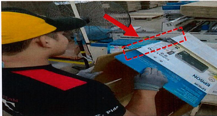
Outside checking of the glue tab portion

Note: To be included on the work instruction.